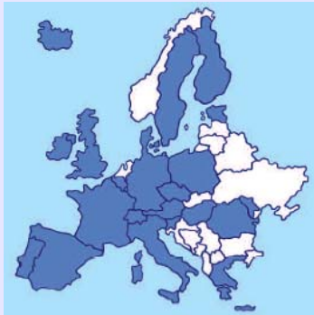
European countries currently represented in the EPCN (see website for a full list of participants)