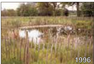
Fig 1 CH32/96

Fish were deliberately introduced at two sites, one prior to the 1996 survey, though the loss of fringing emergent vegetation was probably more important. At the other (CH32/96 Fig. 1) created as a receptor pond in mitigation of development disturbance) Perch ( Perca fluviatilis ) were introduced by illicit anglers. At three others, fish have been introduced or have spread from adjacent ditches and a canal during flood events. Sticklebacks ( Gasterosteus aculeatus ) have become a considerable problem, especially where little flexible vegetation is present in ponds or emergent and little submerged marginal vegetation cover is available due to inappropriate management or shading.