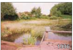
Fig. 3 CH44/96

Thinning or loss of emergent vegetation arose from its destruction by wading cattle (2 cases), shading by overhanging scrub (2 cases); and by dredging (1). Boarding of pond margins preceded the 1995 survey in all three cases where this is a significant factor in preventing the spread of emergent vegetation (2 Golf courses, and 1 environmental education centre - CH44/96 Fig. 3). The failure to find T. Cristatus at these ponds in 2006 may be a delayed consequence of this boarding, which prevents slumping and maintains an abrupt margin accessible to predatory fish.