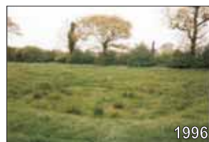
Fig. 5 CH22/96

At four ponds, no clear reason could be identified for the loss of T. cristatus . It was suspected that the population recorded in 1995/6 was too small to remain viable. At one site, 2 adjacent ponds (CH22/96 Fig. 5 and CH23/96) both held tiny populations in 1996 but no evidence was found in 2006. These two ponds are part of a cluster, linked by ditches and with high mobility of sticklebacks ( Gasterosteus aculeatus ). It is possible that the population is primarily dependent on one or more key ponds, which recruit well in good breeding years. Other satellite ponds may subsequently be the site of breeding attempts when the adult population is high. One other pond was considered an unlikely breeding site because of the unsuitability of surrounding terrestrial habitat. The pond appears in better condition in 2006, but was probably another satellite pond, dependent in this case upon a pond since drained. There remains the possibility that small populations of T. cristatus were missed during the survey, in particular where no negative change in condition of aquatic or terrestrial habitat is evident. This applies in one case, where little evidence could be found in 1995, conditions in the pond remain highly suitable, and the retention of unmown field margins now constitutes an improvement in terrestrial conditions.