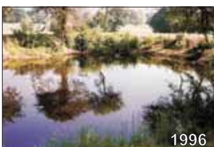
Fig 2 CH61/96

At 2 ponds dense growth of scrub has suppressed and reduced marginal emergent vegetation providing egg laying substrate and refugia for younger larvae, and caused chilling of the water, slowing development of eggs and larvae (CH61/96 Fig. 2). At another, fringing rough grassland in 1995 has turned to dense scrub over bare soil.