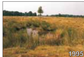
Fig. 4 CH113/95

The importance of open water is often overstated, but T. cristatus does require more depth of water and ease of movement than the common Lissotriton vulgaris . At 1 pond, dredged to about 1m deep shortly before the 1995 survey, a field drain silted the pond, now containing less than 0.15m of water, with one open pool 0.3m in depth. 80% of the pond surface is vegetated, the pool having a bed of silt where newts are highly visible and vulnerable to predation. T. cristatus could not be found in 2006. One pond (CH113/95 Fig. 4) was less than 0.5m deep in 1995 and only 40% vegetated. By 2006 vegetation cover increased to 95% and T. cristatus could not be found. One development mitigation pond, neglected since 1995, rapidly silted due to its small size, with accompanying spread of Glyceria fluitans . At another a fringe of Glyceria fluitans and Ranunculus aquatilis with shallow pools was kept open by the trampling of cattle. The surrounding pasture is now grazed by sheep (avoiding wet areas and insufficiently bulky to maintain open pools) so the outer zone of the pond is densely grassed over, and T. cristatus could not be found in 2006. In extreme cases, water was lost twice through drainage, once through in-filling.